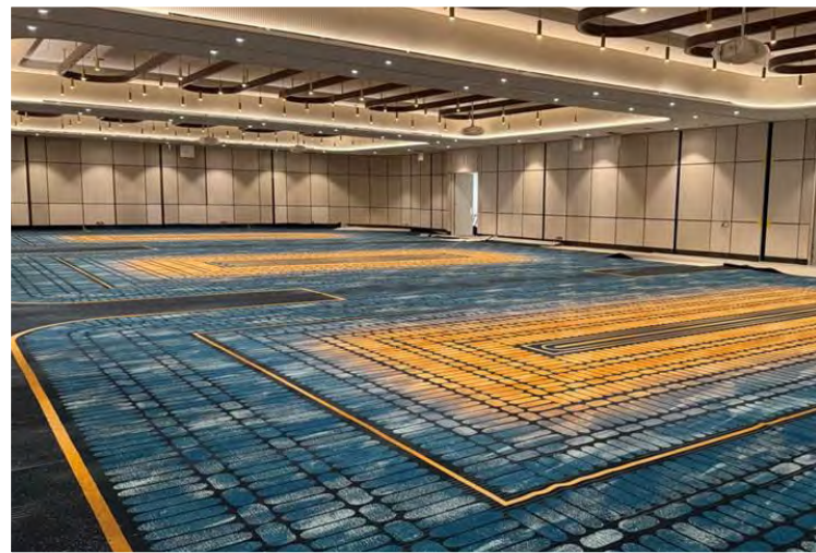
Above - 'Events at 8' function space

Just like the saying goes, Good things come in threes. Members and the community of Penrith will also be thrilled to note that Penrith RSL will take on the Management of the Kemps Creek Sporting and Bowling club to share amenities with its members. This facility expands upon the services available to members of Penrith RSL and the wider community.